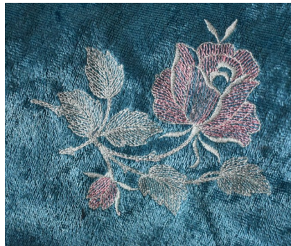
Teal Blue Velvet Dark Gray Faux Fur Lining Delicate Rose Embroidery