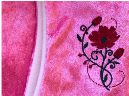
Bright Pink Velvet Light Pink Fleece Lining Floral Embroidery