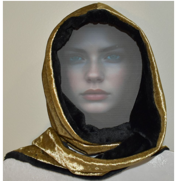
Slinky Gold Velvet, Very Elegant Black Faux Fur Lining