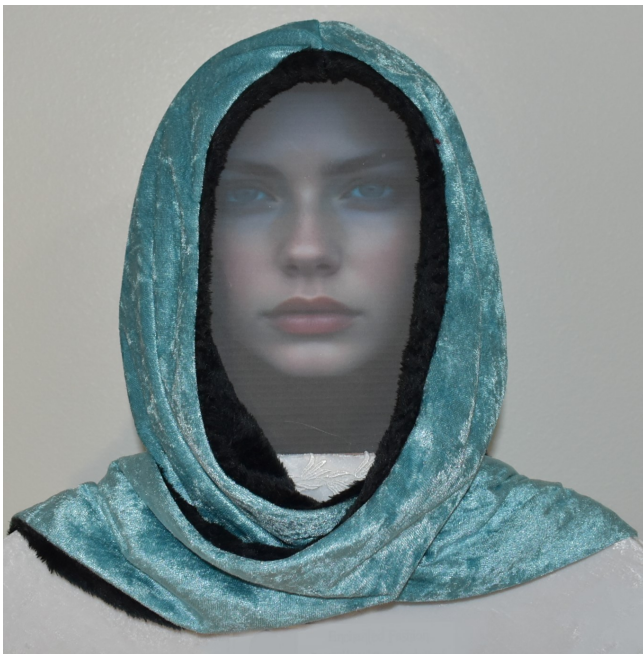
Turquoise Velvet Black Faux Fur Lining